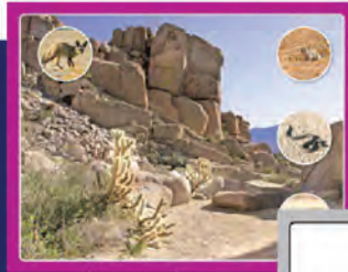
Flashcards to make an interactive learning.