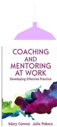
Connor, Coaching and Mentoring at Work: Developing Effective Practice