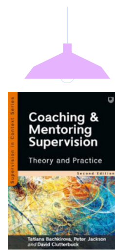
Bachkikova, Coaching and Mentoring Supervision: Theory and Practice

Unlock the full potential of teaching and learning with the Open University Press and McGraw Hill Coaching collection—crafted to meet the needs of today's educators and students. Libraries and departments can purchase a one year's eBook subscription through their aggregator of choice, with unlimited access for all students. With nearly 40 titles , this comprehensive collection covers subjects ranging from Coaching, Mentoring, Supervision, Leadership Development, Professional Growth, and Transformational Conversations. Every title combines academic rigour with practical application, preparing students for real-world success.