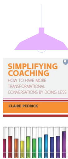
Pedrick, Simplifying Coaching