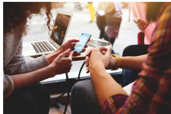
Learning that Fits mheducation.link/smartbook2